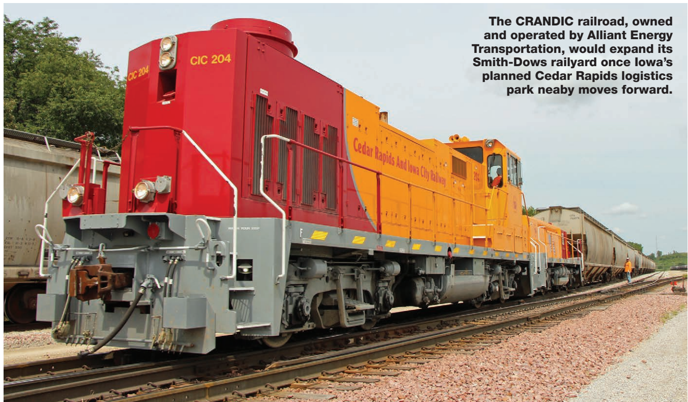
The CRANDIC railroad, owned and operated by Alliant Energy Transportation, would expand its Smith-Dows railyard once Iowa's planned Cedar Rapids logistics park nearby moves forward.

The logistics park is also expected to further benefit by being located directly south of the Smith-Dows railyard which is operated by Alliant Energy Transportation's Cedar Rapids and Iowa City (CRANDIC) Railway Co. Before the logistics park site was even picked, Alliant Energy Transportation's parent—utility company Alliant